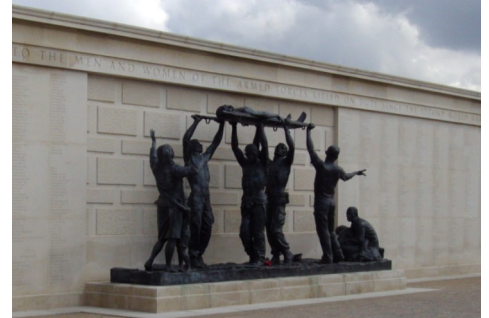
Sculpture at the National Memorial Arboretum

Created in 1997, the National Memorial Arboretum is a special place that remembers those who have served, and continue to serve, our nation in many different ways. With some 50,000 trees already planted, and 160 dedicated memorials established on the site, the Arboretum is a living tribute to the sacrifices made by the armed and civil services of this country. There is a large area devoted to Police who have fallen while on duty, as well as other areas given over to the Fire & Rescue and Ambulance services.